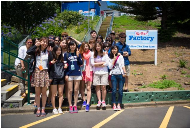
(Students during trip to Tip Top factory)