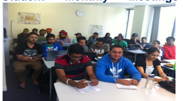
(Students attending monthly meeting with Principal)