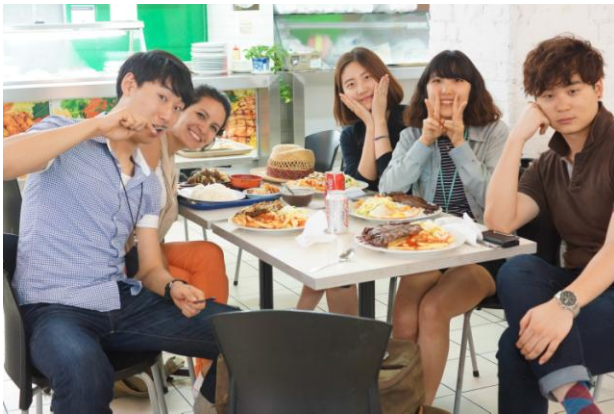
(Students enjoying food during Rotorua trip)