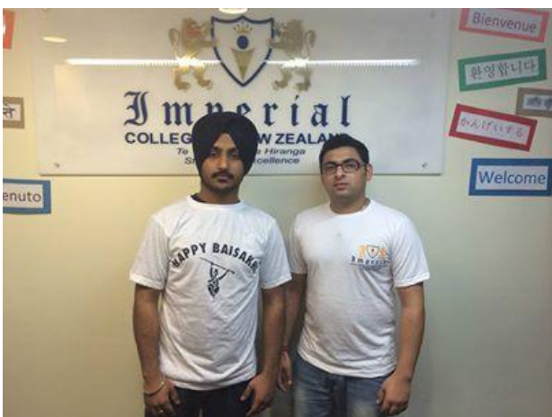
(Students getting ready to celebrate Baisaki Festival)