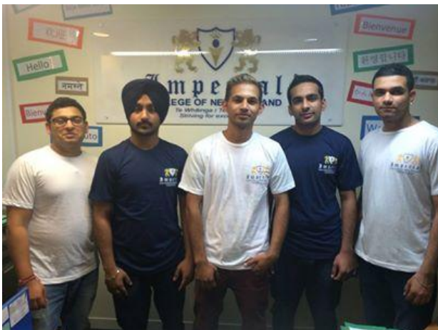
(Students getting ready to celebrate Baisaki Festival)